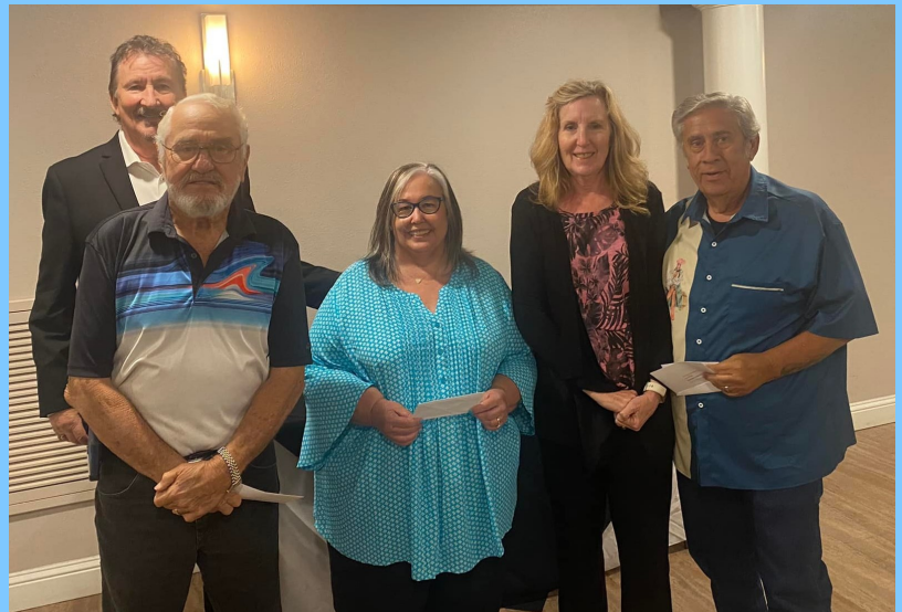
EXCELLENT ATTENDANCE AWARD RECIPIENTS