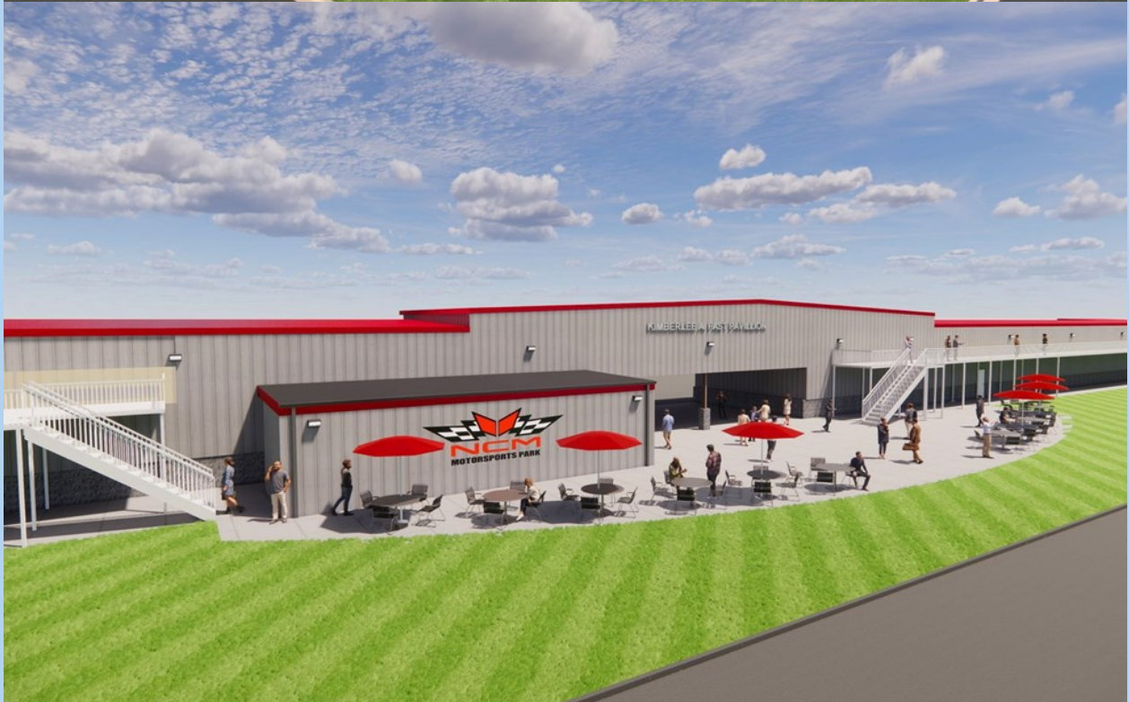
Kimberly A. Fast Pavillion